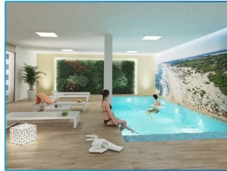
PISCINA / SWIMMING POOL

- Plano realizado sobre proyecto básico, las cotas o superficies facilitadas podrían verse ligeramente alteradas en fase de ejecución -