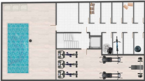
SÓTANO / BASEMENT