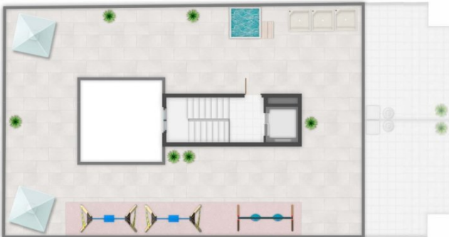
CUBIERTA / ROOFTOP