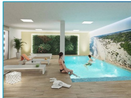
PISCINA / SWIMMING POOL

- Plano realizado sobre proyecto básico, las cotas o superficies facilitadas podrían verse ligeramente alteradas en fase de ejecución -