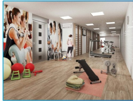
GIMNASIO / GYM