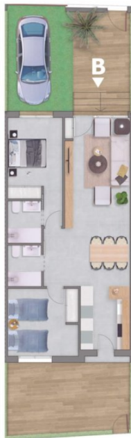
Planta baja / Ground Floor