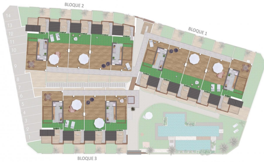
Planta Solarium / Topfloor