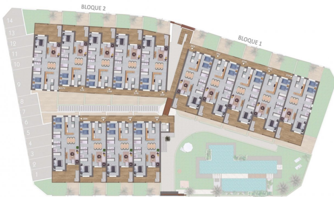
Planta Primera / First Floor