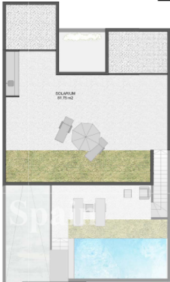
HOUSE 3 SOLARIUM