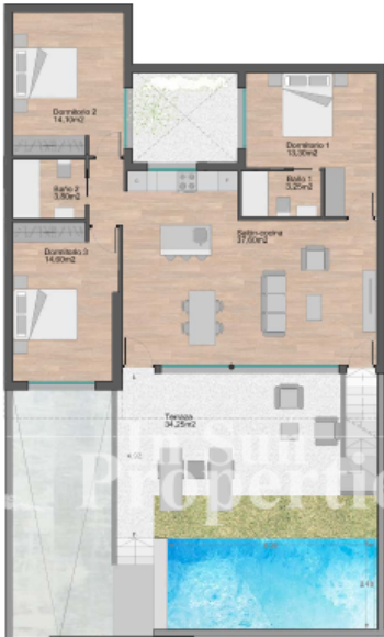
HOUSE 3 GROUND FLOOR