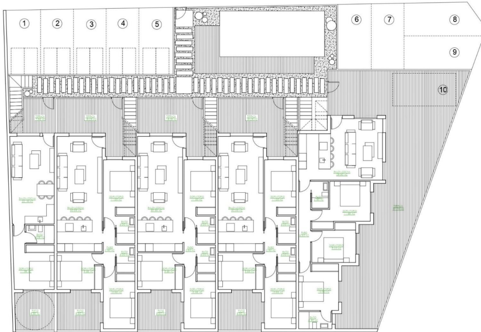
Planta Baja Conjunto