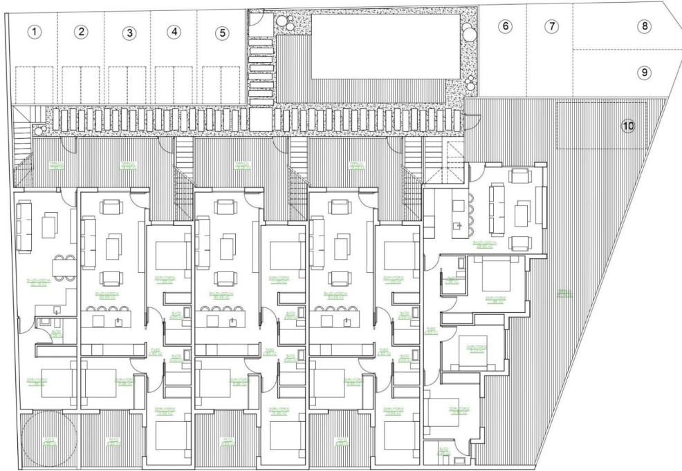
Planta Baja Conjunto