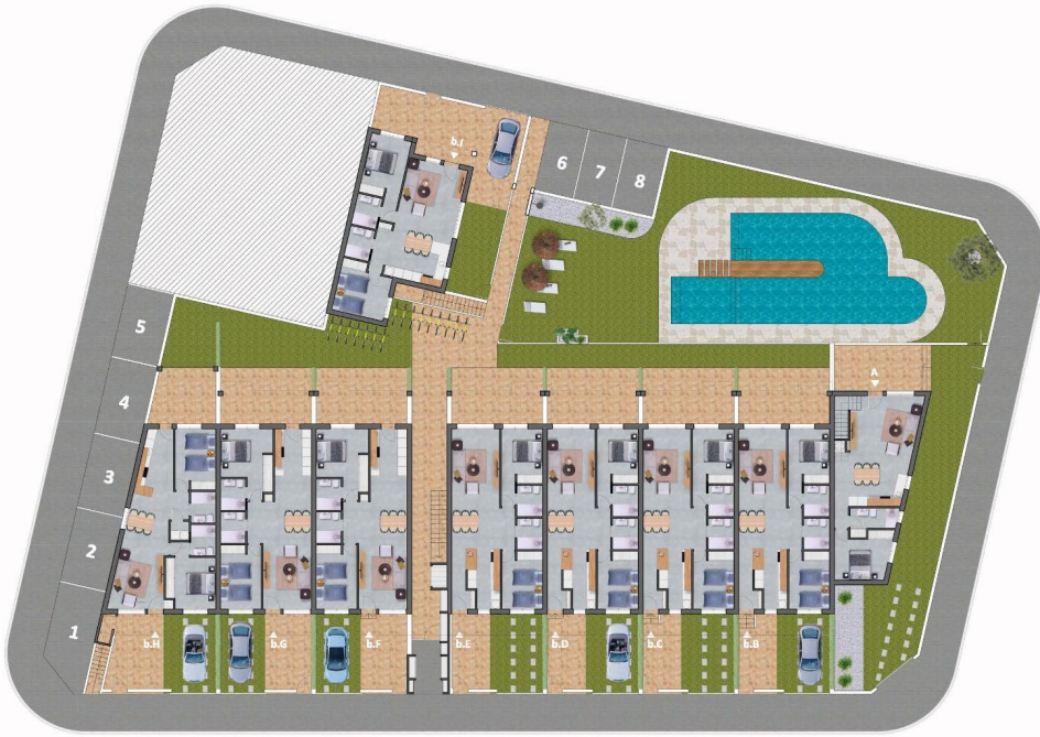
Planta baja / Ground floor