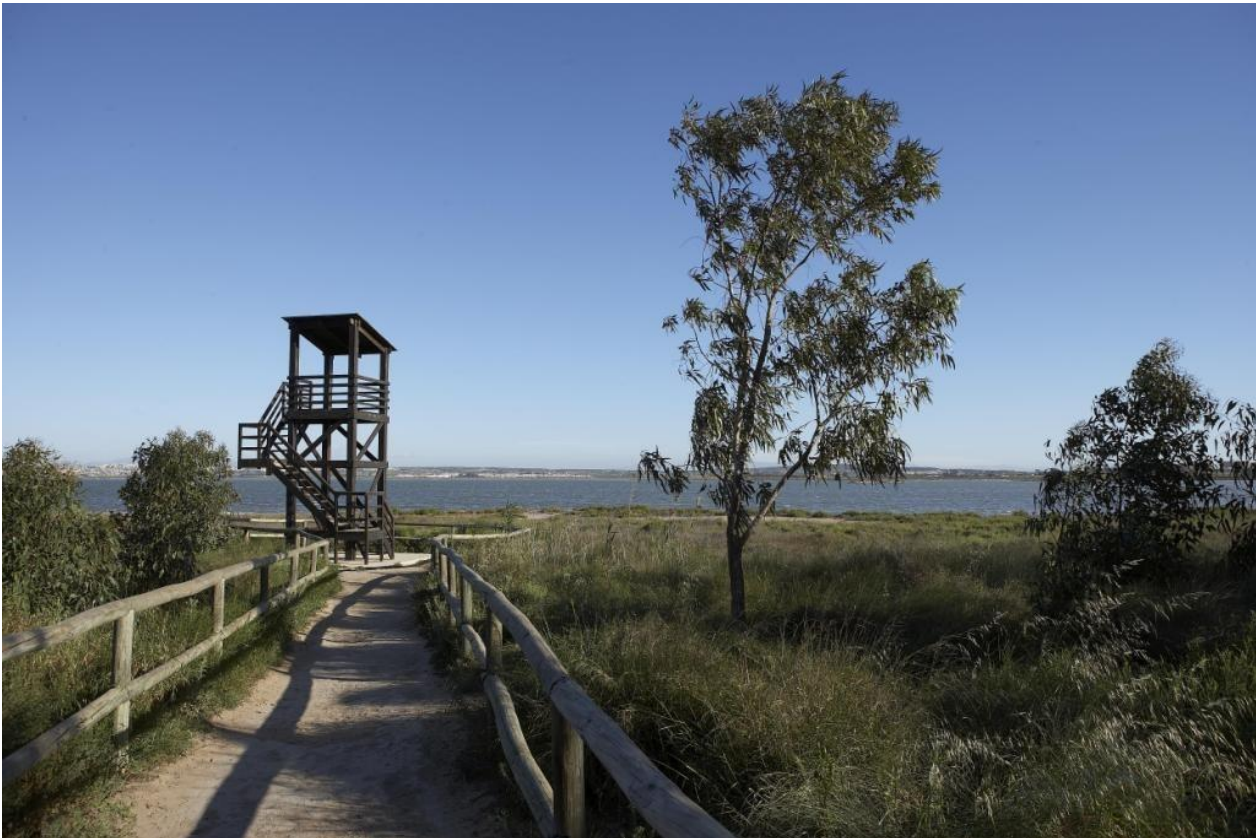
Imagen informativa sin escala / Informative image not scaled and subject to changes. Se reserva el derecho de modificaciones por motivos técnicos, jurídicos o comerciales.