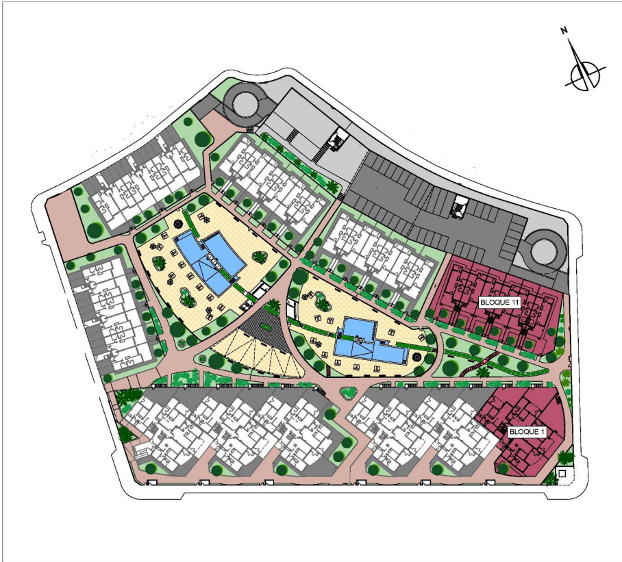
PLANTA DE CONJUNTO (FASE 1)

Este documento (tanto su parte gráfica como los datos referidos a superficies) tienen carácter meramente orientativo, sin perjuicio de la información más exacta contenida. Los datos referidos a superficies son meramente orientativos y pueden sufrir variaciones como consecuencia de exigencias comerciales, jurídicas, técnicas o de ejecución de proyecto.