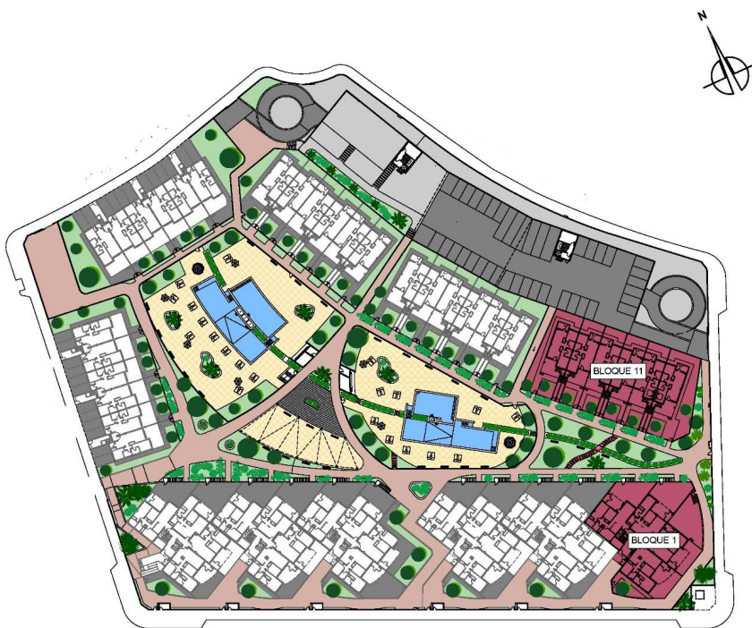
PLANTA DE CONJUNTO (FASE 1)

Este documento (tanto su parte gráfica como los datos referidos a superficies) tienen carácter meramente orientativo, sin perjuicio de la información más exacta contenida. Los datos referidos a superficies son meramente orientativos y pueden sufrir variaciones como consecuencia de exigencias comerciales, jurídicas, técnicas o de ejecución de proyecto.