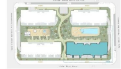
BLOQUE 1 - Solarium