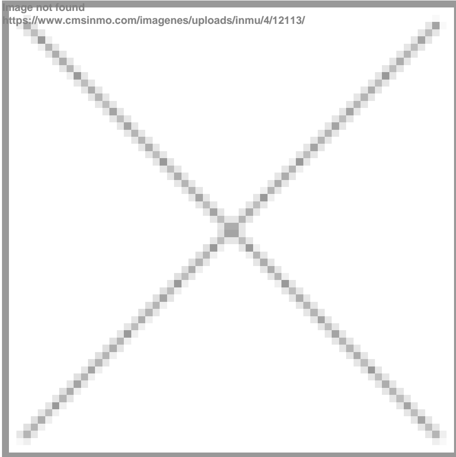
Image not found https://www.cmsinmo.com/imagenes/uploads/inmu/4/12113/