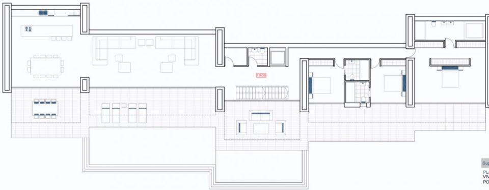
PLANTA ALTA (