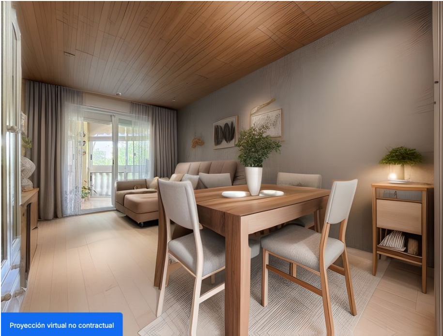
Proyección virtual no contractual